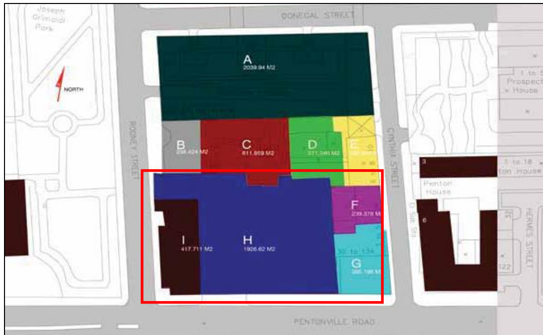
Land Ownership and Site Areas Diagram (Sites F, G, H and I make up the application site – outlined by the red rectangle)

scheme viability. However, without the agreement with Europcar, this site would not come forward for development.